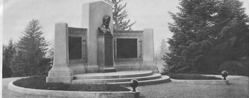
Gettysburg Address Memorial, Gettysburg National Cemetery.

fields, battered by Union artillery most of the way, the attackers now converged upon Meade's center. Momentarily the long lines were slowed by the rail fence at the Emmitsburg Road, then they rushed up the slope of Cemetery Ridge toward "The Angle" in the stone wall.